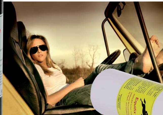
Available size: 500 ml

Apply to the leather with a soft cloth. Let work in shortly and then wipe off any excess leather care with a clean cloth.