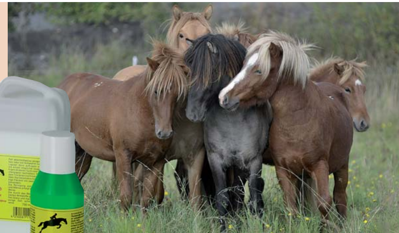
Available sizes: 500 ml - 2 l - 5 l - 10 l

Use Equiclean® Outdoor & Sensitiv just like a regular shampoo. Gently massage it into the coat and hair, leave briefly to take effect, and then rinse it out.