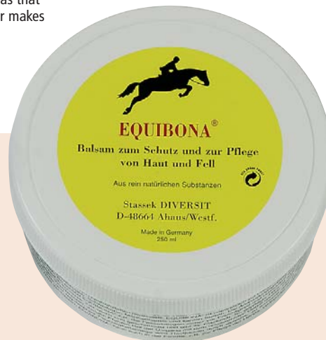
Available size: screw-top box 250 ml

Also read the description of EquidouX® and Equimin®.