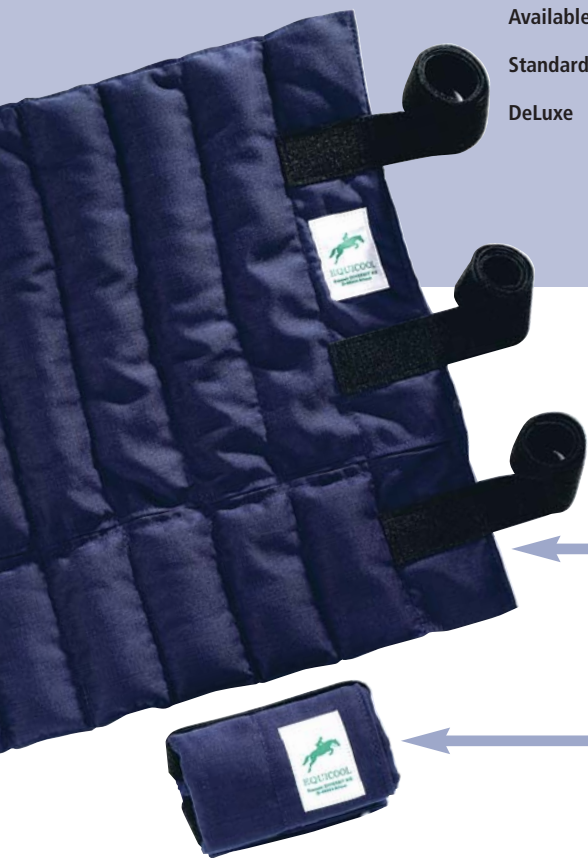
Equicool ® leg wrap De Luxe

DeLuxe (long size – cools from the coronet band up to carpus or hock)