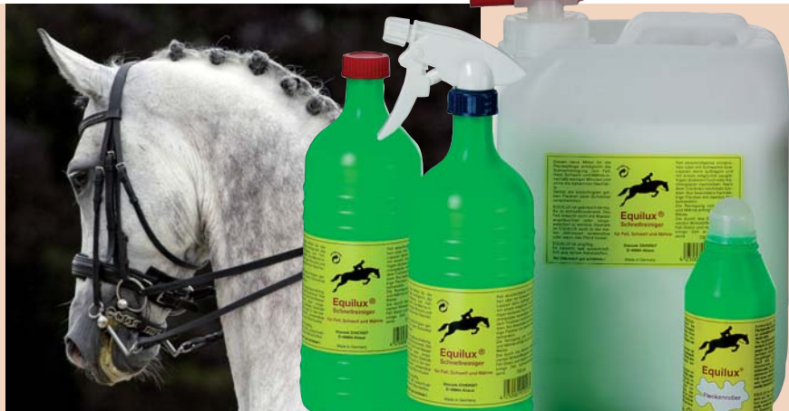
Available sizes: 250 ml - 750 ml - 2 l - 5 l - 10 l

There is no need to wash the horse before the application of Equilux®. Equilux® quick cleanser is ready to use. Spray on the dry and roughly cleaned coat or apply with a sponge, then wipe with an absorbent cloth or kitchen tissue. Persistent stains can be treated for a second time. After drying brush over again with a dandy brush and the stain is gone. Clean mane and tail in the same way.